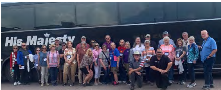
Here's one of the bus tours that enjoyed a tour of Miracle of America Museum. This group of seniors arrived on June 11 from all over the US.

This year's big Polson July 4th parade crowd applauded MOAM's four vehicles. All made it back to the museum under their own power. We thank volunteers for devoting a good part of their holiday to share the Miracle of America with the public!